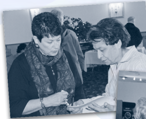
Talking with constituents at my October senior fair for area residents at Port 'N' Starboard at Ocean Beach in New London. The event, held for seniors and their family members, featured dozens of service providers and vendors who participated with displays and exhibits to showcase programs, products and services directed toward older residents.